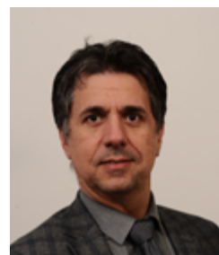
By Marco Buoni (ATF, Italy), TF Chairman

The phase-down of HFCs in the context of the Fgas Regulation is accelerating the uptake of low GWP alternative refrigerants. Data from the EPEE Gapometer seems to suggest that such an uptake is actually faster than foreseen. It is therefore all the more important to ensure that the industry is ready and adapts quickly to these changes.