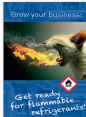
Leaflet Flammable Refrigerants