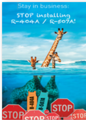
Leaflet R-404A/ R-507A