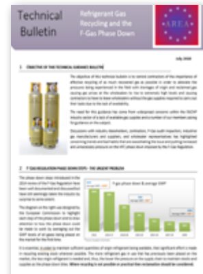
Technical Bulletin on Recycling

All publications can be downloaded at http://area-eur.be/publications