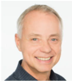
By Stig Rath (VKE, Norway), TF Chairman

Most RACHP contracting companies are faced with staff shortages, difficulties to hire and the need to upskill their workforces. Our Task Force Skills tries to support the industry to address these challenges.