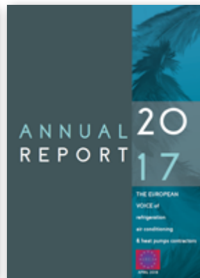
Annual Report 2017