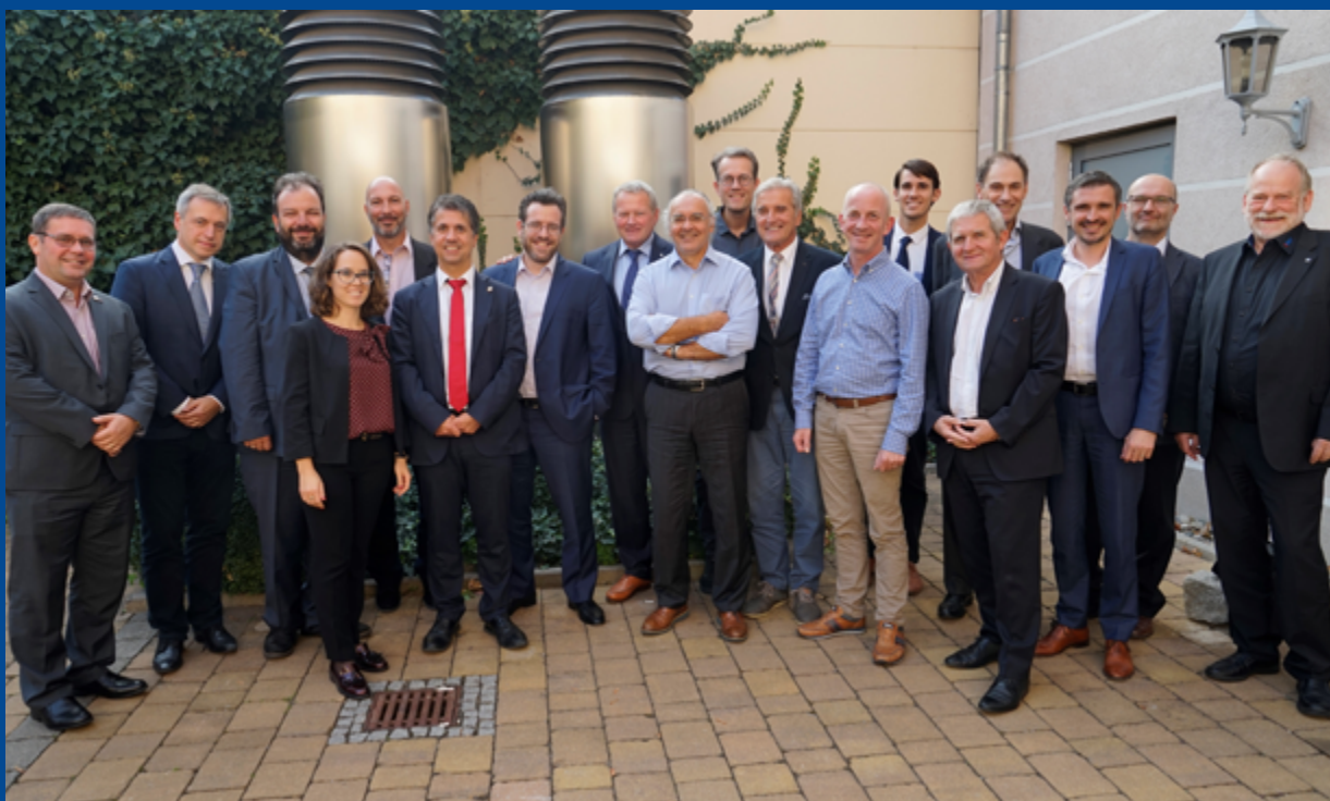
AREA members at the autumn meeting in Nuremberg

25-26 May, Vienna & 19 October, Nuremberg