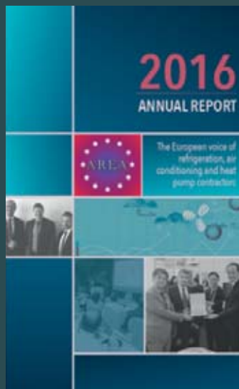
ANNUAL REPORT 2016