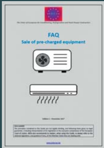
FAQ ON SALE OF PRE-CHARGED EQUIPMENT